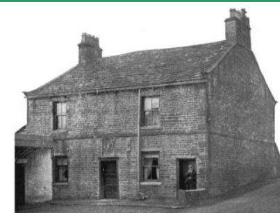
OLD HALL FARM

A 9 mile circular walk closely following the parish boundaries of the historic village of Huncoat