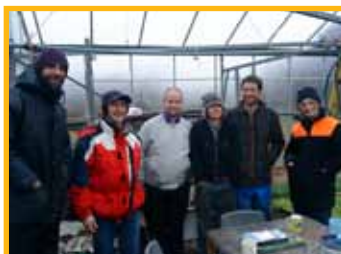
A visit to a food growing enterprise in Manchester

At the start of the programme the Social Enterprise Officer met with 45 Hyndburn based community groups and organisations to try and identify possible environmentally-themed social enterprise ideas. From this consultation process a total of 16 fledgling ideas were identified. Each of these ideas was then assessed for 'robustness' by a panel of experts from the voluntary, charity and social enterprise sector in east Lancashire. Eight of the strongest ideas were progressed to the next phase of development.