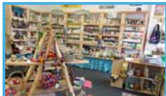
Inside the shop

A key feature identified early on was that of the 'co-operative' model. This came through from visits to similar shops in the North West and it fitted with the groups' idea of how they wanted to run the business.