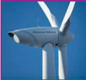
A 500kW PowerWind turbine

Windy is still under development due to the very large sums of money needed to install a wind turbine, i.e. in excess of £1,000,000. A group of local residents has been established and is working towards a scheme to install a 500kW wind turbine on a site in Hyndburn. The intention is to set up an Industrial and Provident