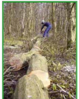
Thinning a woodland compartment at Jackhouse Nature Reserve in Oswaldtwistle

Woody is now looking to establish a permanent base for the operation whilst also looking for new volunteers. Anyone interested in Woody should contact Prospects for more details.