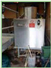
Rocket composter at Offshoots Permaculture site in Burnley