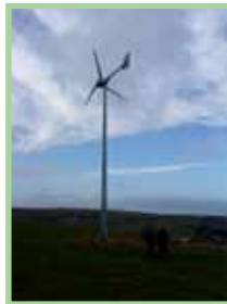
A wind turbine 'Open Day' in Haslingden