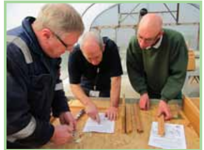
Learning how to build a hive

In total there were 16 potential social enterprises identified during the community consultation exercise. These included an Asian ladies sewing business, a bicycle recycling scheme, using accelerated composters, creating biodiesel from waste vegetable oil, an ethical retail shop, a woodland management enterprise, installing a 'community benefit' wind turbine, setting up a mobile fruit & vegetable van, a reusable nappy scheme, a micro-hydro scheme, setting up a solar photovoltaics & water heating installation company, a home improvement service, local food growing, using rock dust from Whinney Hill landfill as a soil improver, a wood recycling scheme and finally, providing support for an existing social enterprise Hyndburn Used Furniture Store.