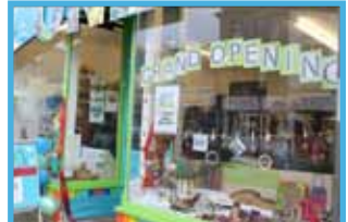
Grand opening of One Planet on Thu 21st Oct 2010

One Planet was the first enterprise set up under the programme. A development group started work on the idea in mid 2009. The group wanted to establish a 'community-owned' ethical retail shop in Accrington where people could go to purchase environmentally friendly, local, ethical, Fairtrade, sustainable and innovative products