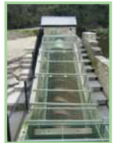
'Torr's Hydro' - An Archimedes screw hydro scheme in Derbyshire