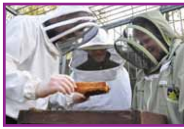
Volunteers learn about beekeeping

Fifteen volunteers have already taken part in a 2-day basic beekeeping course and have also learnt how to build hives. Over the coming years, swarms collected by the council will be used to create new hives. To keep the group sustainable, honey from the hives will be sold through the One Planet shop to fund new hives and equipment.