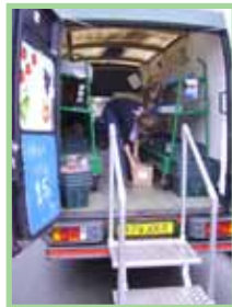
'Herbie', a mobile fruit and veg van in Manchester