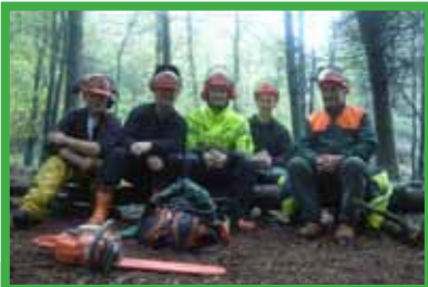
Volunteers on a chainsaw training course

Woody was set up by a group of local volunteers who have a passion for woodlands and want to help manage & expand them in Hyndburn. The group saw the opportunity to set up a community benefit company that could, amongst other things, help to manage local woodlands and make products from the timber.