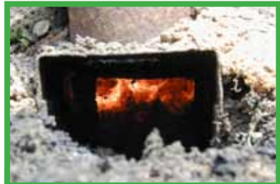
Looking in through the feet of the charcoal kiln during Woody's first 'burn' in Accrington

Woody aims to provide a number of benefits to Hyndburn. Firstly, actively managing woodlands for the benefit of the habitat helps to increase biodiversity. Secondly, making products from the woodland thinnings helps stimulate demand in sustainable woodland products in Hyndburn. Thirdly, Woody is keen to provide training and workshops in woodland crafts for local people. Finally, Woody wants to help increase woodland cover in the borough.